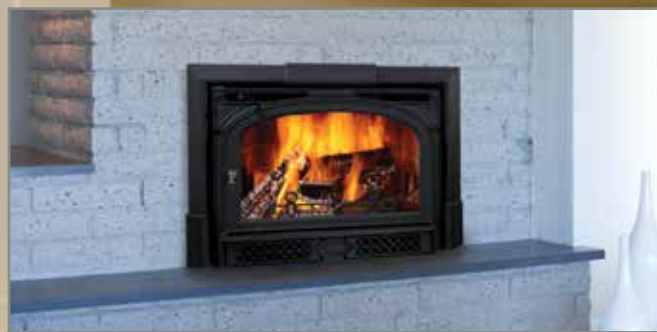
Montpelier shown with Caprice cast iron surround in Classic Black.