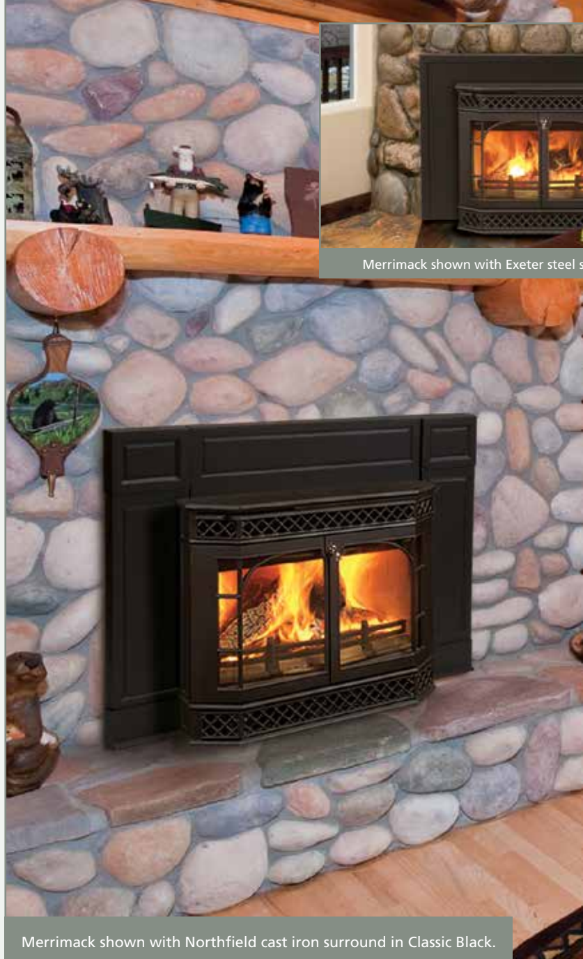
Merrimack shown with Northfield cast iron surround in Classic Black.