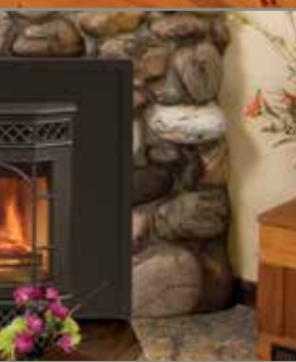
urround in Classic Black.