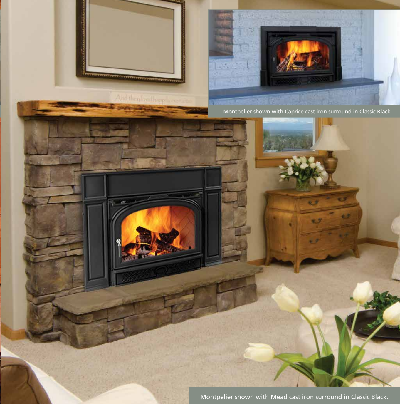
Montpelier shown with Mead cast iron surround in Classic Black.